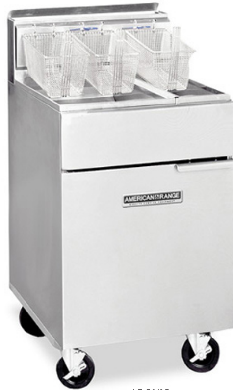
AF-50/25 Shown with optional casters