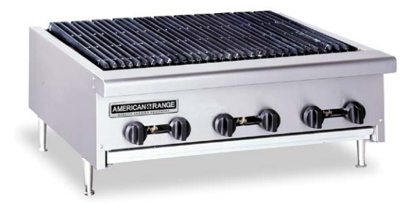
AERB-36 Shown with optional 4" counter legs