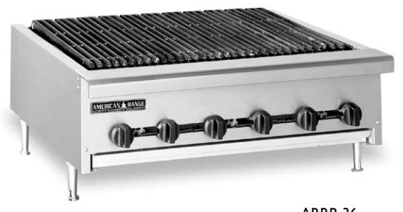
ARRB-36 Shown with optional 4" counter legs