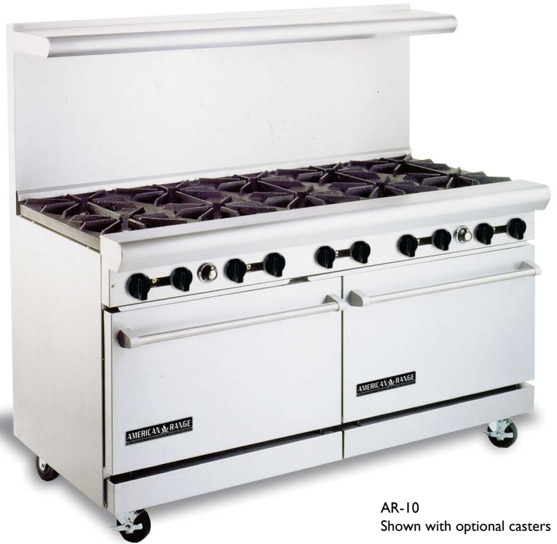
AR-10 Shown with optional casters