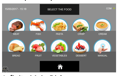
Infinity Main Dishes