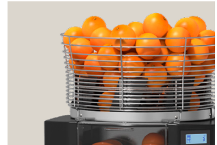
Basket in two sizes

The machine includes a 16 kg capacity basket with lid as standard, which prevents access to the oranges. There is an optional basket with 9 kg fruit load capacity.