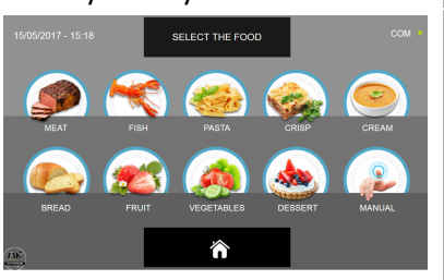
Infinity Main Dishes