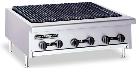
AERB-36 Shown with optional 4" counter legs