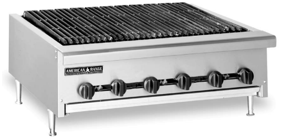
ARRB-36 Shown with optional 4" counter legs