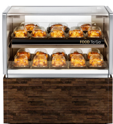
Customizable cladding and materials

Designing a tailor-made counter is easier than ever before with our Custom Counter Configurator. The Fri-Jado team is ready to assist you in configuring your perfect counter by using this tool. The configurator creates a counter that meets your exact needs and visualizes what this could look like in a 3D image.