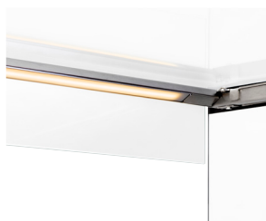
Long life heat-resistant LED lighting