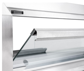
Rear flap doors for easy operator access