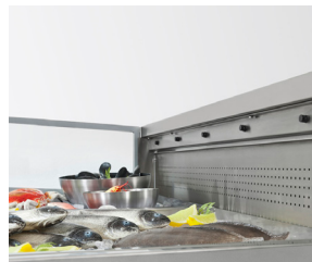
Spray bar nozzles