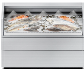
Optional misting system