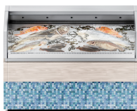
Customizable cladding and materials