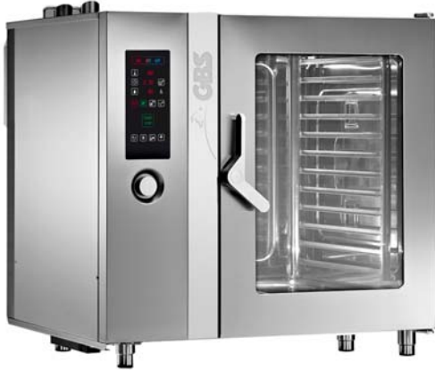
MODEL GBS FX122G2 SHOWN