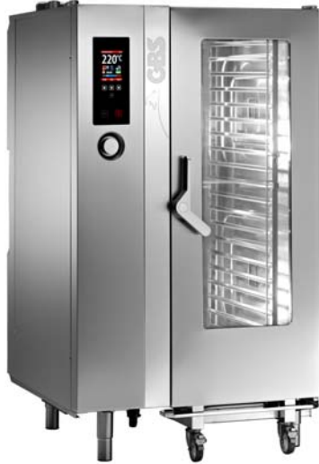
MODEL GBS FX201E3 SHOWN