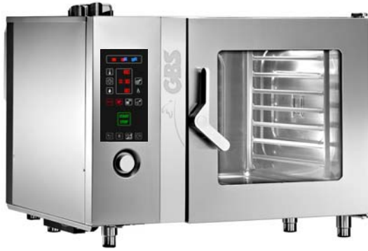
MODEL GBS FX82G2 SHOWN