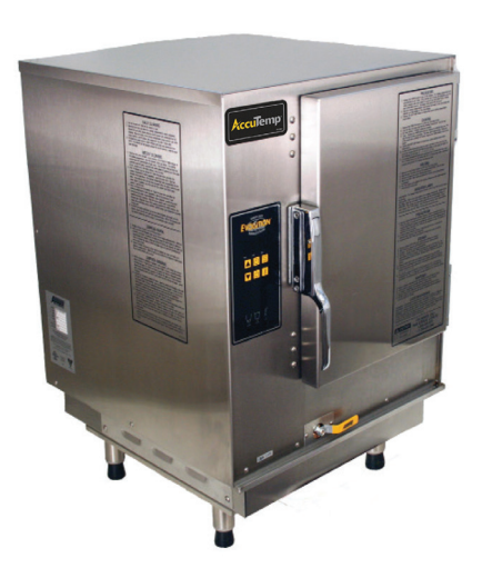
N6 Evolution™ Model shown with optional bullet feet

Evolution<sup>™</sup> steamer is AccuTemp Products' connected, boilerless steam cooker that utilizes AccuTemp's Patent Pending Steam Vector Technology for faster cook times, improved energy efficiency, better pan to pan uniformity, and less water consumption. Steam Vector Technology requires no moving parts inside the cooking chamber. Steam to be produced inside the cooking cavity with no heating components exposed to water. Unit to be powered by a Heavy Duty Stainless Steel Blue Flame Power burner, Easily connects to water, drain & gas lines. Uses less than 1 gallon of water per hour. Unit to include low water, high water, overtemp warning lights and auto shut off feature. Evolution™ to include heavy duty, field reversible door. Standard digital controls with independent timer. No water quality exclusions to warranty and no water filtration or treatment required. Unit to be UL Safety and Sanitation Certified, and Energy Star qualified. Built in USA.