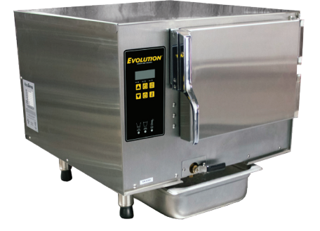
E3 Evolution™ Model shown with optional bullet feet and optional drain pan