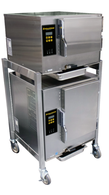
E3 Evolution™ Model shown stacked with E6 model on stand with casters and optional drain pans

Evolution™ steamer is AccuTemp Products' connectionless, boilerless steam cooker that utilizes AccuTemp's patented Steam Vector Technology for faster cook times, improved energy efficiency, better pan to pan uniformity, and less water consumption. Steam Vector Technology requires no moving parts inside the cooking chamber. Steam to be produced inside the cooking cavity with no heating element exposed to water. No water or drain line. Uses less than 1.5 gallons of water per hour. Unit to include low water, high water, overtemp warning lights and auto shut off feature. Evolution™ to include heavy duty, field reversible door. Standard digital controls with independent timer. No water quality exclusions to warranty and no water filtration or treatment required. Unit to be UL Safety and Sanitation Certified, and Energy Star qualified. Built in USA.