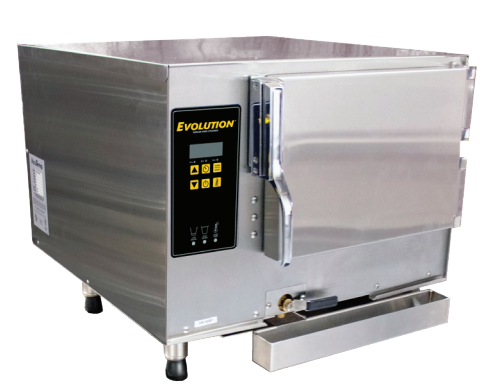
E3 Evolution™ Model shown with optional bullet feet