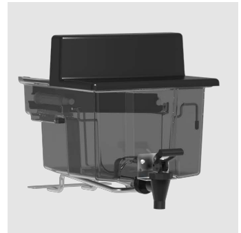
1 gallon reservoir