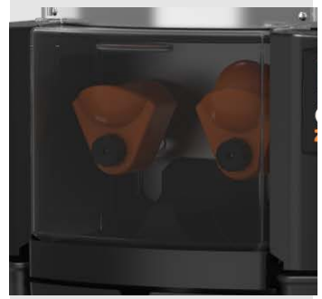
Smoky grey front cover